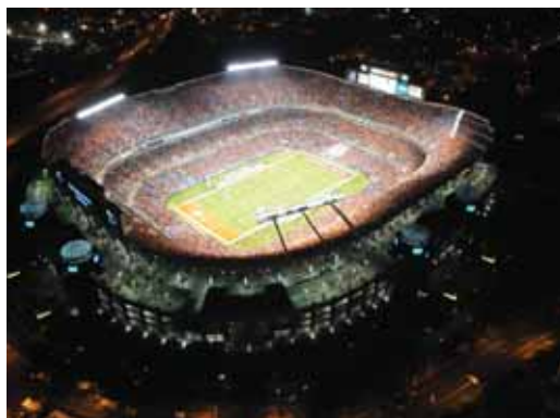
Charlotte's Bank of America Stadium