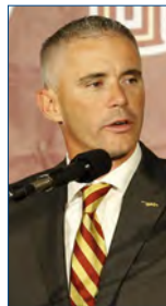
Mike Norvell Florida State

■ Five current league coaches have won ACC Coach of the Year honors - North Carolina's Mack Brown in 1996, Duke's David Cutcliffe in 2012 & 2013, Clemson's Dabo Swinney in 2015 & 2018, Virginia Tech's Justin Fuente in 2016 and Louisville's Scott Satterfield in 2019.