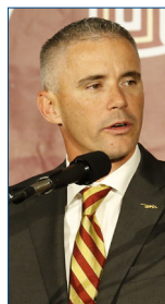
Mike Norvell Florida State

■ Five current league coaches have won ACC Coach of the Year honors - North Carolina's Mack Brown in 1996, Duke's David Cutcliffe in 2012 & 2013, Clemson's Dabo Swinney in 2015 & 2018, Virginia Tech's Justin Fuente in 2016 and Louisville's Scott Satterfield in 2019.