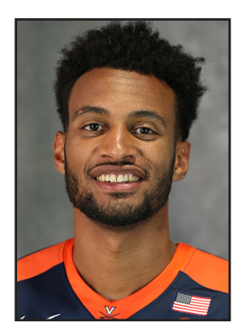
Jr. • F • 6-8 • 225 Charlotte, N.C.