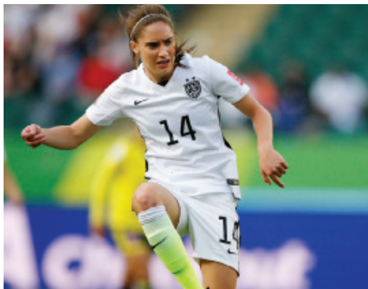
Morgan Brian 2015 World Cup Champion

Caps: 1 (0 starts) Goals: 0 Assists: 0 International Debut: July 13, 2010 vs. Sweden in Omaha, Neb.