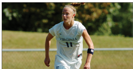
Becky Sauerbrunn 2007 ACC Defensive Player of the Year