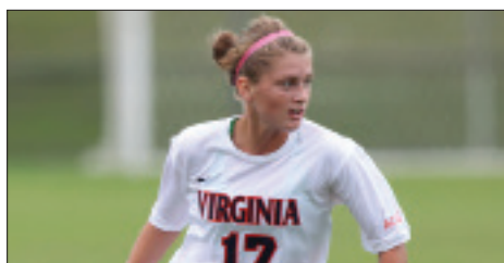
Sinead Farrelly 2010 ACC Offensive Player of the Year