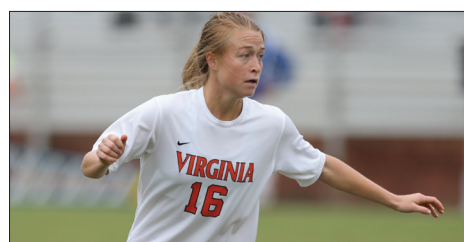
Emily Sonnett 2015 ACC Defensive Player of the Year