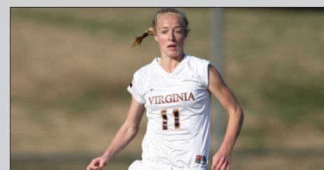
Becky Sauerbrunn 2003 ACC Freshman of the Year