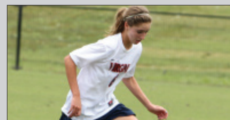
Morgan Brian 2011 ACC Freshman of the Year