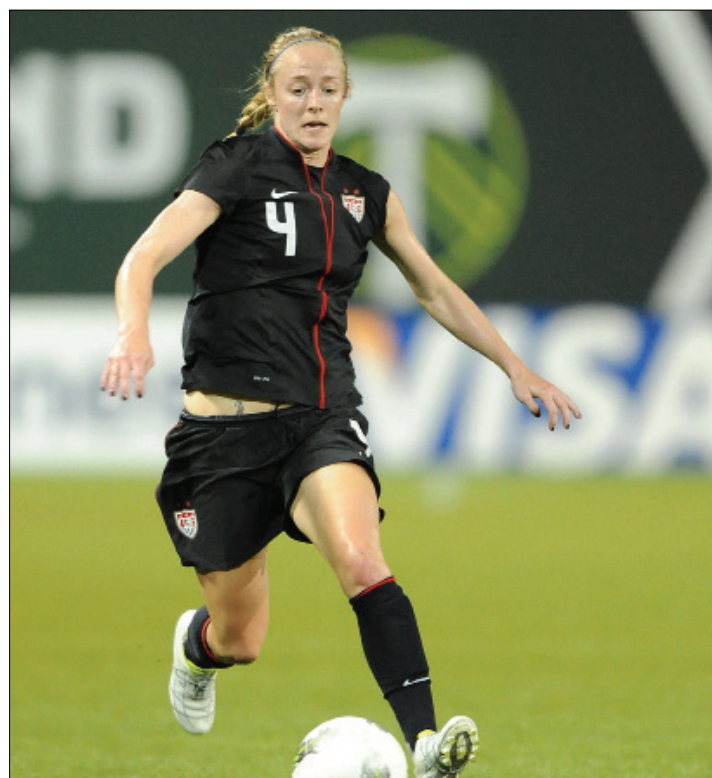
Becky Sauerbrunn 2012 Olympic Gold Medalist 2015 World Cup Champion