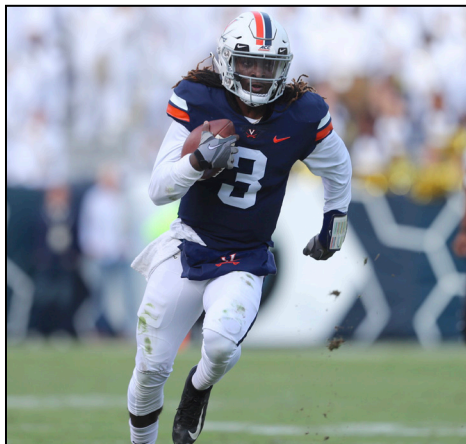
Against William & Mary in week No. 2, QB Bryce Perkins became the 44th Cavalier in program history with 1,000 career rushing yards. He is only the third UVA quarterback to reach the milestone and the first since Shawn Moore in 1990.