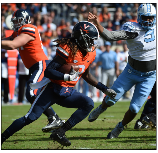
QB Bryce Perkins rushed for one touchdown and threw for three more in a 31-21 victory the last time these teams met. Perkins accounted for 329 yards of total offense with 217 passing yards and 112 rushing yards.