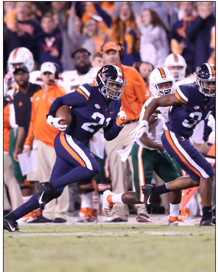
SS Juan Thornhill made two interceptions, earning Walter Camp National Defensive Player of the Week honors the last time these two teams played.