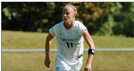
Becky Sauerbrunn 2007 ACC Defensive Player of the Year