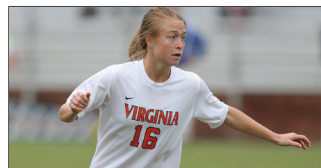
Emily Sonnett 2015 ACC Defensive Player of the Year