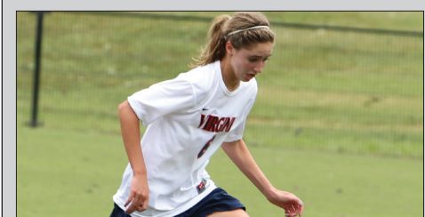
Morgan Brian 2011 ACC Freshman of the Year