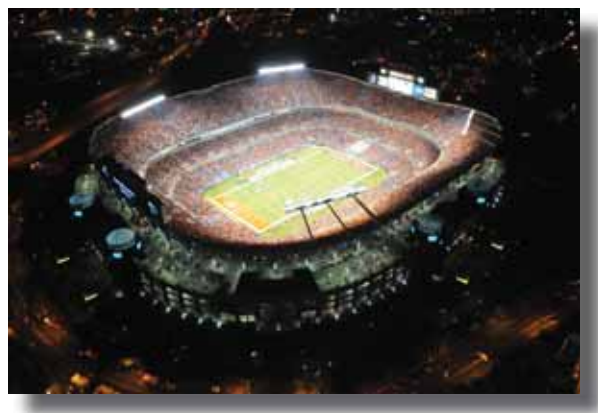
Charlotte's Bank of America Stadium