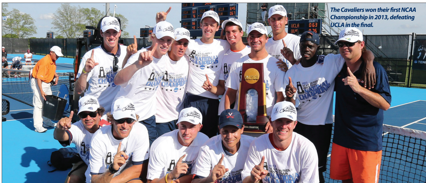
The Cavaliers won their first NCAA Championship in 2013, defeating UCLA in the final.