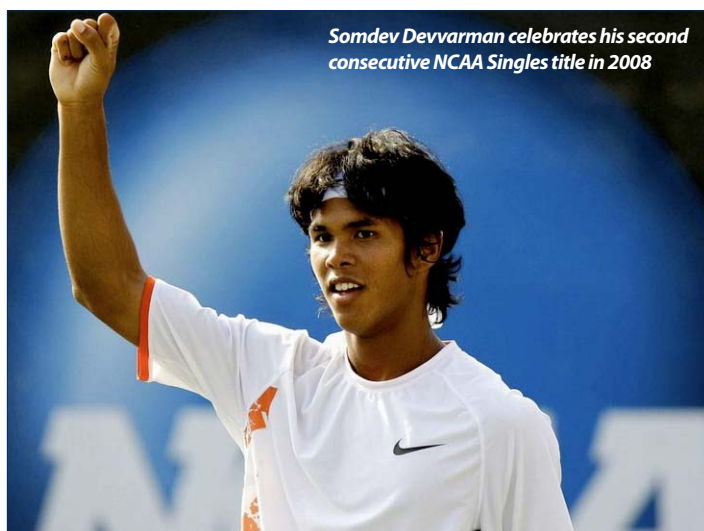
Somdev Devvarman celebrates his second consecutive NCAA Singles title in 2008

Devvarman ended the season with a 44-1 singles record, tying the school record for wins in a season he set a year before. He was the first NCAA Singles Champion to finish the season with one or fewer losses since UCLA's Jimmy Connors went undefeated in 1971. Since then, NCAA Champions have included Georgia's Pernfors, Stanford's John McEnroe, Stanford's Tim Mayotte, and Texas's Kevin Curren, all of whom went on to be ranked in the world top 20, but lost multiple times in college during their championship season.