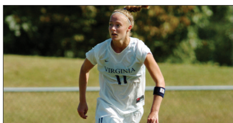
Becky Sauerbrunn 2007 ACC Defensive Player of the Year