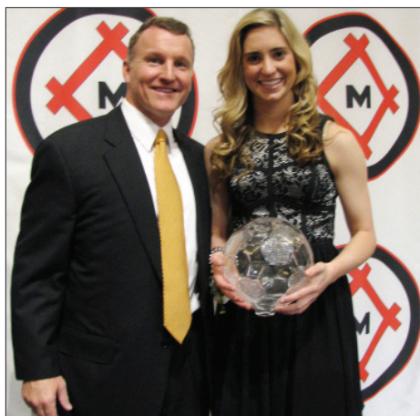
Morgan Brian 2013 MAC Hermann Trophy