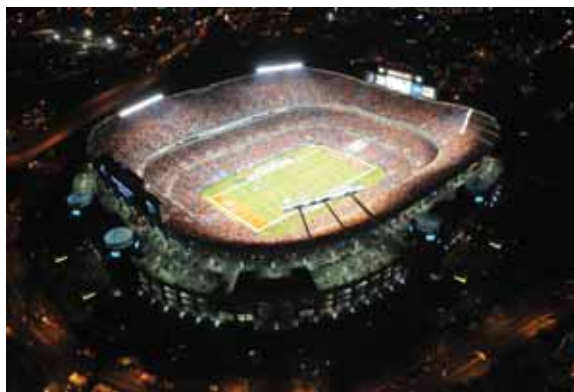
Charlotte's Bank of America Stadium