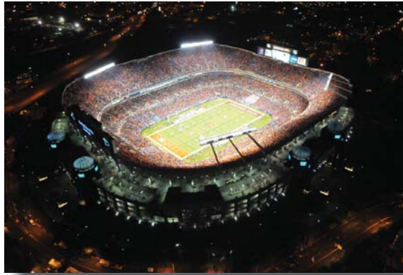
Charlotte's Bank of America Stadium