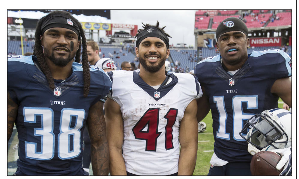
W&M's six NFL Draft picks since 2009 leads the CAA and ranks second among all FCS programs. Additionally, it ranks behind only Virginia and Virginia Tech in the state of Virginia.

The three losses came against Delaware, 2015; JMU, 2014; Villanova, 2013.