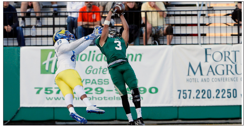
W&M led the nation in pass defense last season, allowing just 154.2 yards per game. En route to posting the impressive figure, W&M held more than half its opponents (six) to no more than 125 passing yards.