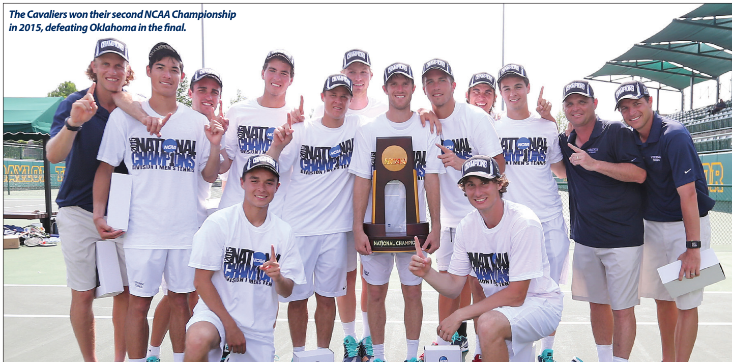
The Cavaliers won their second NCAA Championship in 2015, defeating Oklahoma in the final.