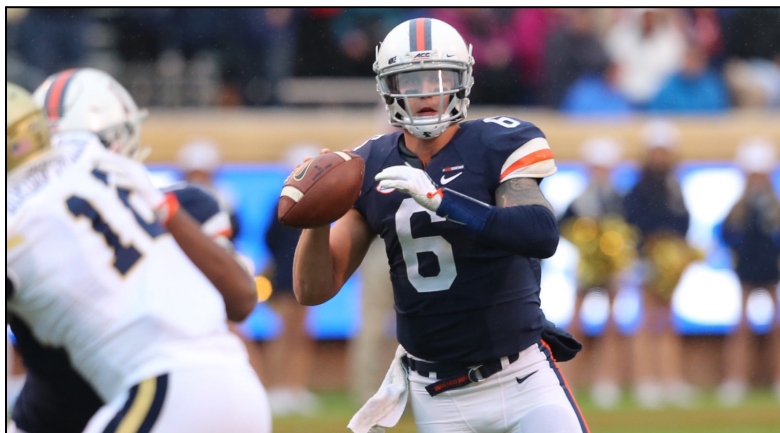
QB Kurt Benkert is No. 3 all-time at UVA with 5,614 career passing yards. He also ranks No. 3 all-time with 46 career passing touchdowns.