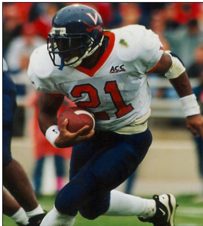
TB Tiki Barber returned a punt 74 yards for a touchdown the last time Virginia and Navy met in football. It is still the fifth-longest punt return for a touchdown in program history. It currently is tied for eighth longest punt return in UVA history.