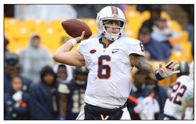
QB Kurt Benkert moved to No. 9 all-time at UVA with 4,570 career passing yards. He also ranks No. 3 all-time with 38 career passing touchdowns.