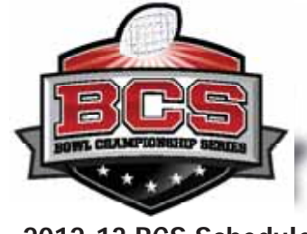
2012-13 BCS Schedule

Jan. 1. Rose Bowl Game Presented by Vizio (ESPN) ...... 5:10 pm Jan. 2.. Allstate Sugar Bowl (ESPN).... 8:30 pm