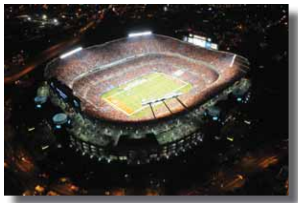
Charlotte's Bank of America Stadium