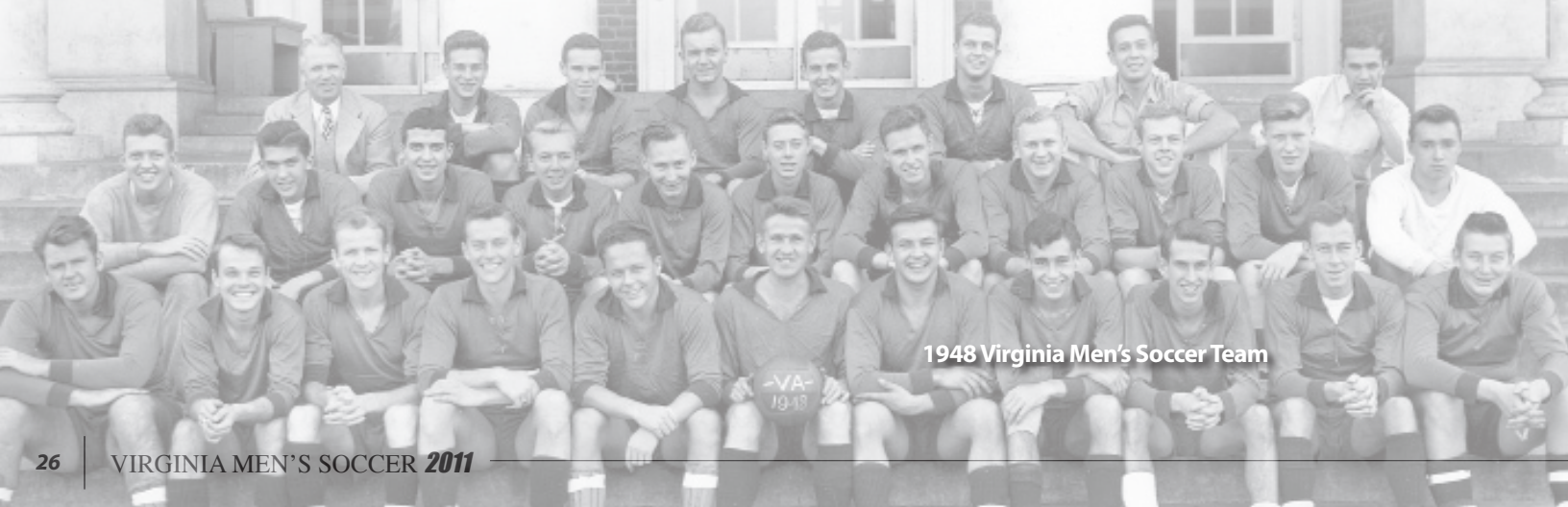
1948 Virginia Men's Soccer Team