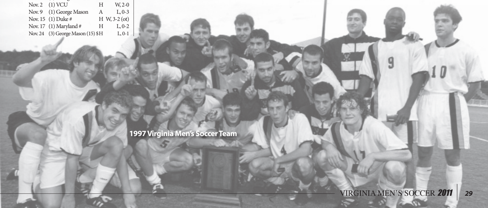
1997 Virginia Men's Soccer Team