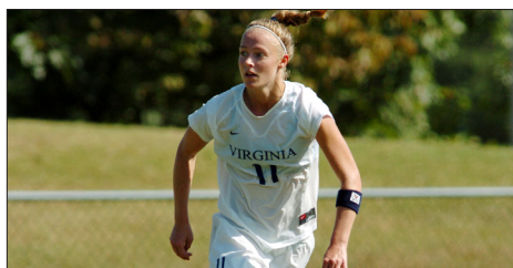
Becky Sauerbrunn 2007 ACC Defensive Player of the Year