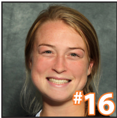
#16 EMILY SONNETT So. • M/D • 5-7 Marietta, Ga. (Fellowship Christian)