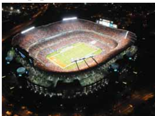
Charlotte's Bank of America Stadium