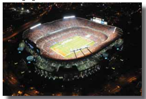
Charlotte's Bank of America Stadium