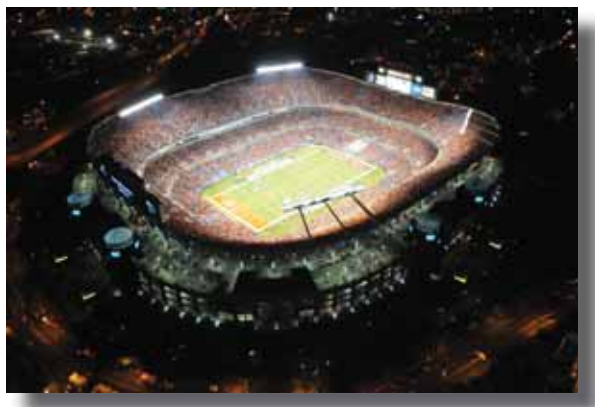
Charlotte's Bank of America Stadium