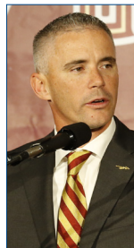
Mike Norvell Florida State

■ Five current league coaches have won ACC Coach of the Year honors - North Carolina's Mack Brown in 1996, Duke's David Cutcliffe in 2012 & 2013, Clemson's Dabo Swinney in 2015 & 2018, Virginia Tech's Justin Fuente in 2016 and Louisville's Scott Satterfield in 2019.