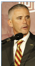
Mike Norvell Florida State

■ Five current league coaches have won ACC Coach of the Year honors - North Carolina's Mack Brown in 1996, Duke's David Cutcliffe in 2012 & 2013, Clemson's Dabo Swinney in 2015 & 2018, Virginia Tech's Justin Fuente in 2016 and Louisville's Scott Satterfield in 2019.