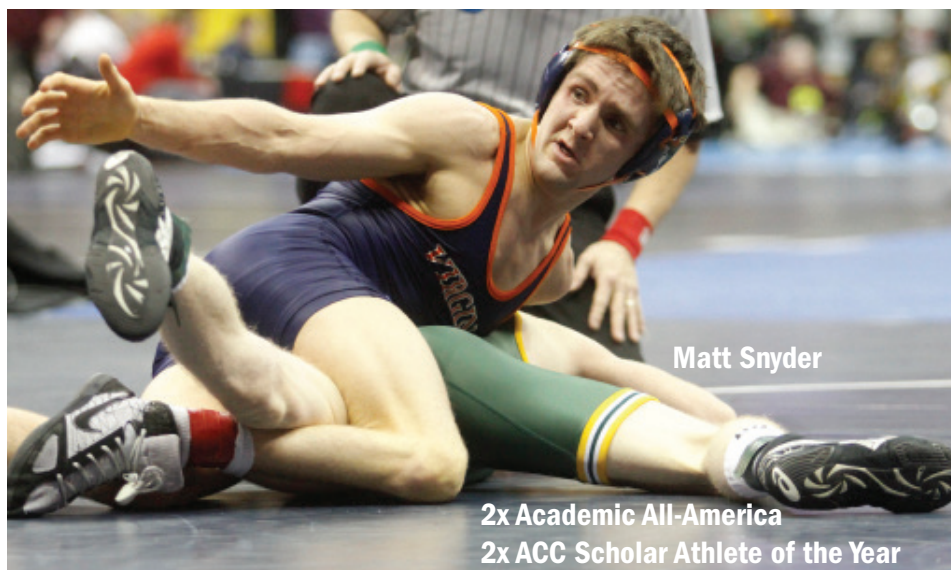
2x Academic All-America 2x ACC Scholar Athlete of the Year