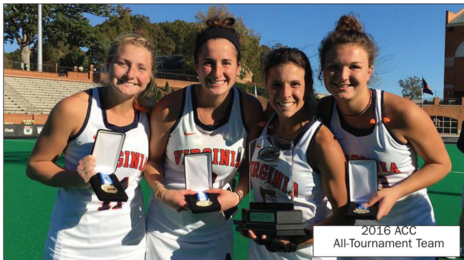
2016 ACC All-Tournament Team