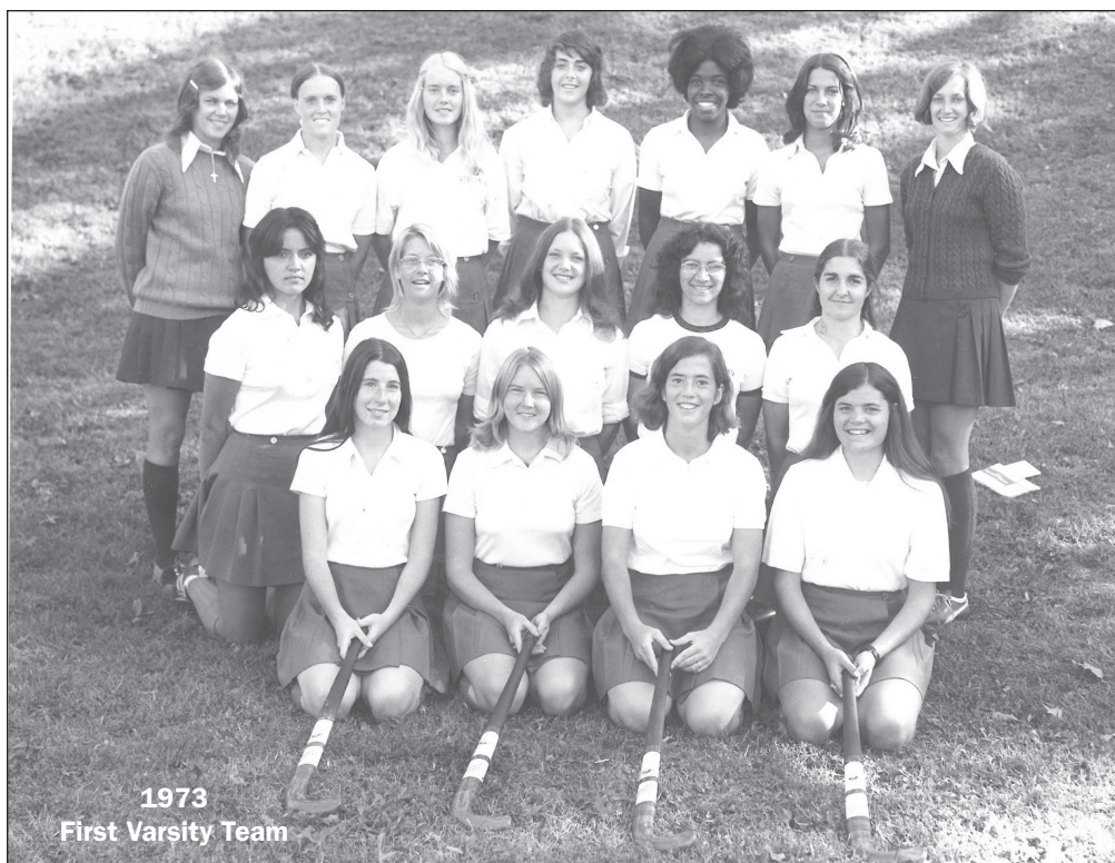
1973 First Varsity Team