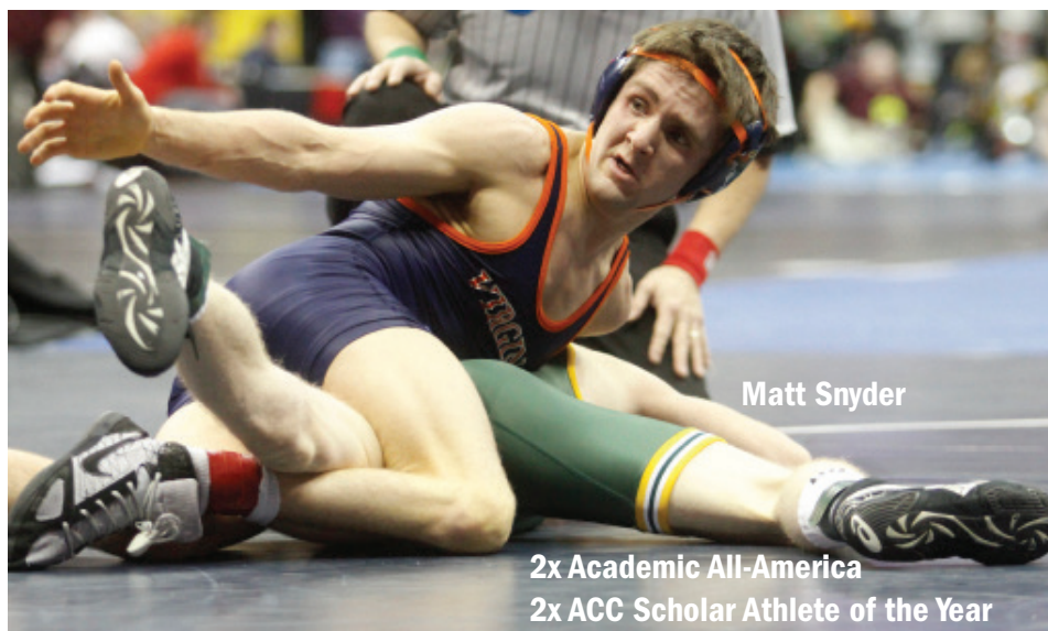
2x Academic All-America 2x ACC Scholar Athlete of the Year