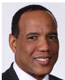
Kevin Keatts Head Coach Eighth Season