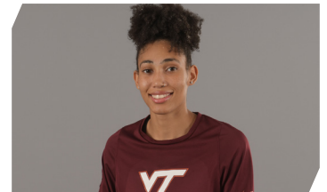
NO. 14 KINDER