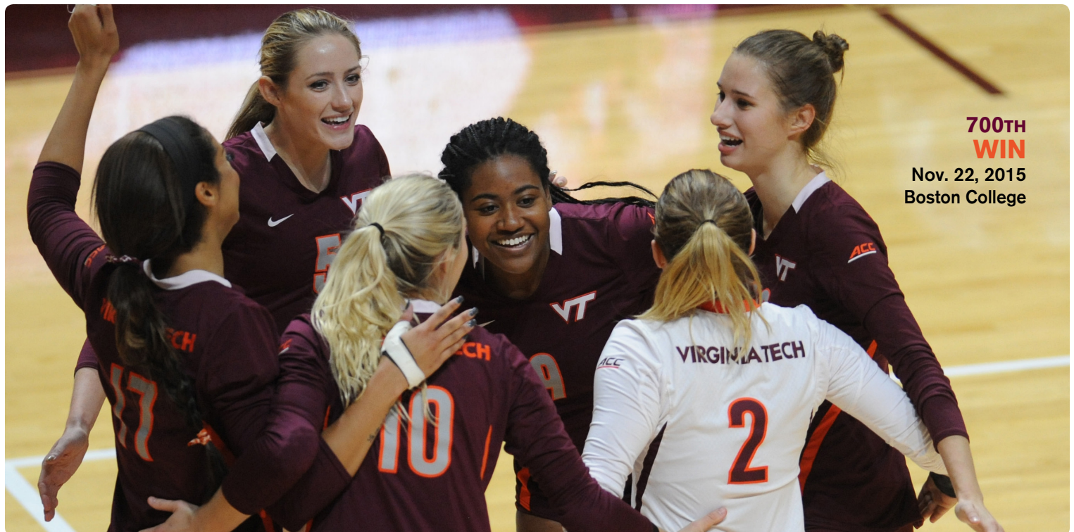
700TH WIN Nov. 22, 2015 Boston College

*In 2001, the NCAA implemented a 30-point rally-scoring system, and in 2008 a 25-point rally-scoring system. Records from 2001-08, and 2008 on, reflect the 30- and 25-point scoring systems, respectively.