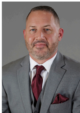
Buzz Williams Head Coach