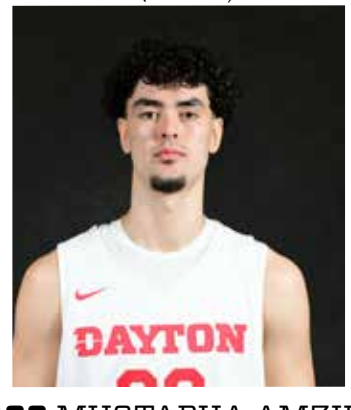
R-FRESHMAN • FORWARD 6-9 • HELSINKI, FINLAND C