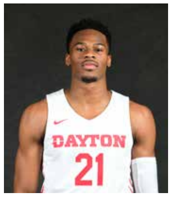
R-FRESHMAN • FORWARD 6-9 • LONDON, ENGLAND