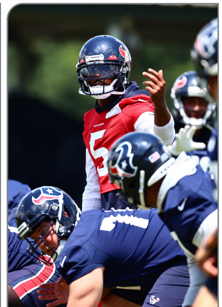
Photos of G Wyatt Teller, RB Khalil Herbert, CB Kyle Fuller, S Chuck Clark and QB Tyrod Taylor