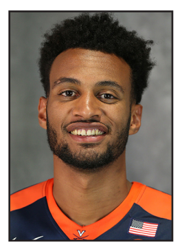
Jr. • F • 6-8 • 225 Charlotte, N.C.