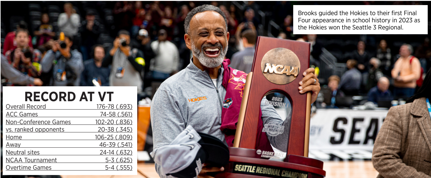
Brooks guided the Hokies to their first Final Four appearance in school history in 2023 as the Hokies won the Seattle 3 Regional.