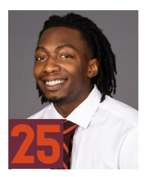
SR. • F • 6-7 • 220 MILLVILLE, N.J. DELAWARE