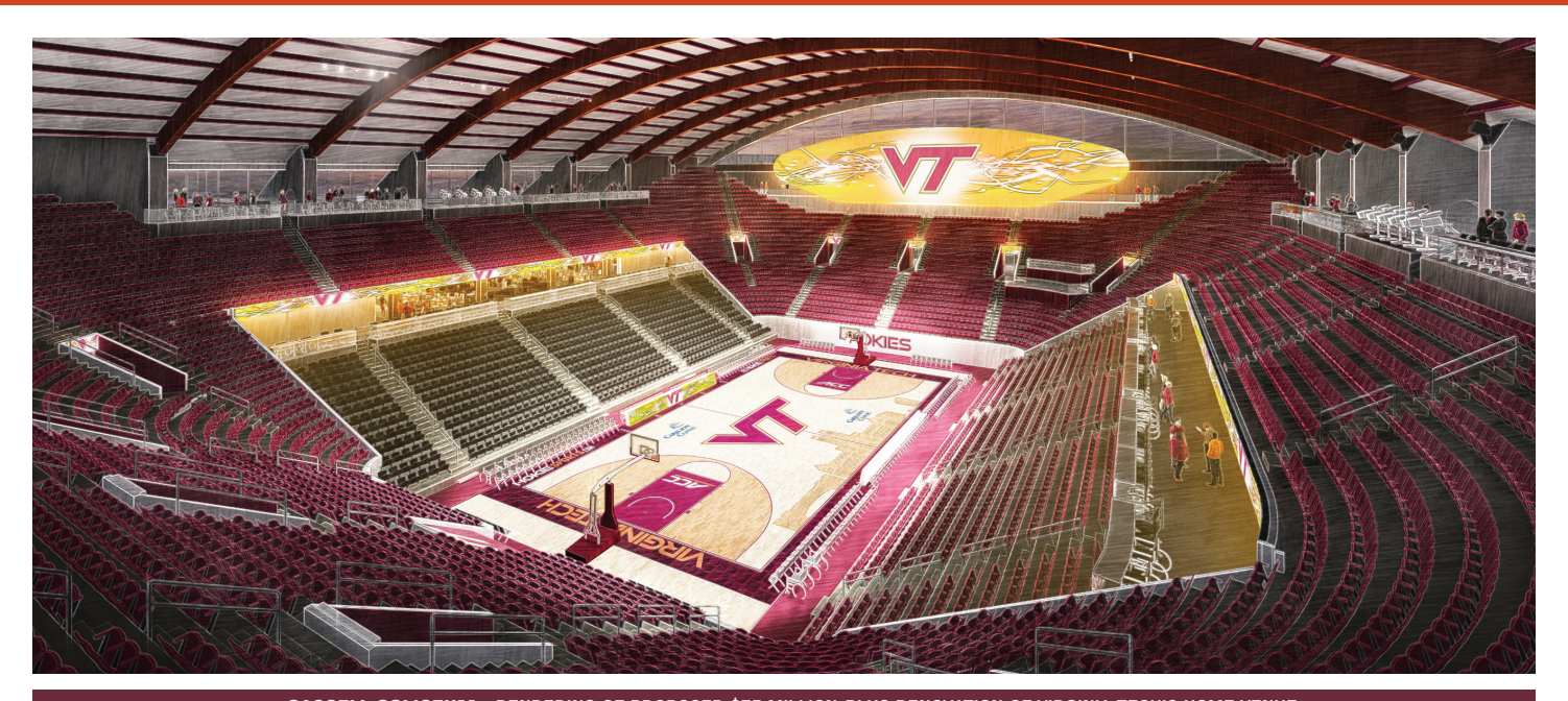
CASSELL COLISEUM - RENDERING OF PROPOSED $75 MILLION-PLUS RENOVATION OF VIRGINIA TECH'S HOME VENUE