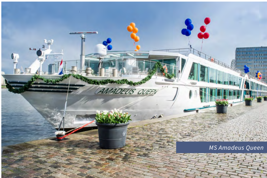
MS Amadeus Queen

After disembarking, we will travel to the airport for your flight home, taking with you warm memories of new places and friends. (B)