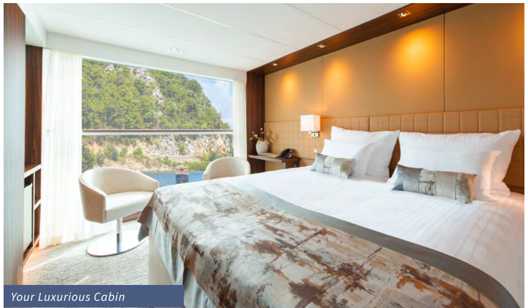
Your Luxurious Cabin

Today you will enjoy a tour of the city of Munich. Admire architectural wonders like the Old Town Hall, St Peter's Church and the Munich Residenz; stroll through the lively Viktualienmarkt; and see the world-famous Hofbräuhaus beer hall. Accompanied by an expert guide, you'll have ample opportunities to learn more about Munich's history, cultural heritage and beer-brewing legacy, while walking between the central squares of Marienplatz and Odeonsplatz. Continuing on you will enjoy a scenic drive to Passau, a fairy-tale city founded more than 2,000 years ago,