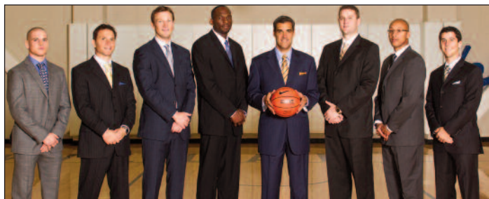
The 2012-13 Villanova Basketball Staff

Date of Birth: Dec. 24, 1961 Education: Council Rock H.S. (1979); Bucknell University (1983) Assistant Coaching Experience: University of Rochester (1984-86); Drexel (1986-87); Villanova University (1987-92); UNLV (1992-94) Head Coaching Experience: Hofstra (1994-2001); Villanova (2001-present)