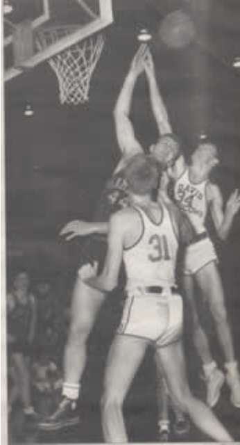
VU vs. Lipscomb