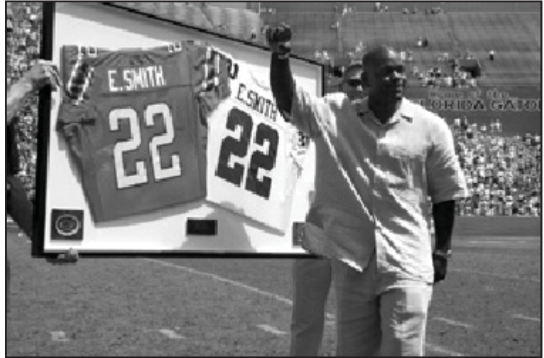
On April 12, 2003, Florida fans got the opportunity to recognize one of their own as Emmitt Smith was honored at halftime of the 2003 Orange and Blue Spring game.

Former Gator Emmitt Smith became the NFL's all-time leading rusher on Sunday, Oct. 27, 2002, with an 11-yard run against the Seattle Seahawks in Dallas. Smith surpassed the long-time record held by Walter Payton, who rushed for 16,726 yards.