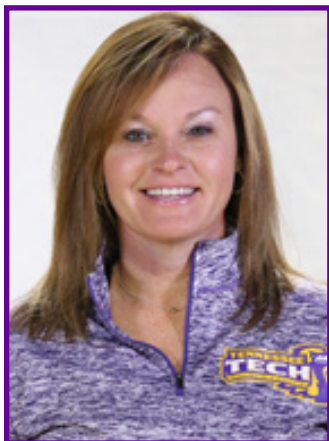
OLE MISS, 1998 FIRST SEASON