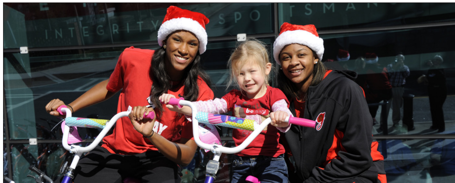
Georgia players pose with a young Lady Bulldog fan during the team's annual Bike Build.