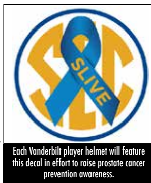
Each Vanderbilt player helmet will feature this decal in effort to raise prostate cancer prevention awareness.

Vanderbilt-Ingram Cancer Center experts are also onboard for this important awareness and prevention campaign. VICC provides multidisciplinary care for men seeking information, screening options and leading-edge treatment for prostate cancer. Men who want to know more about their risks for prostate cancer or who are seeking care may schedule an appointment at VICC by calling toll free 1-877-936-8422.