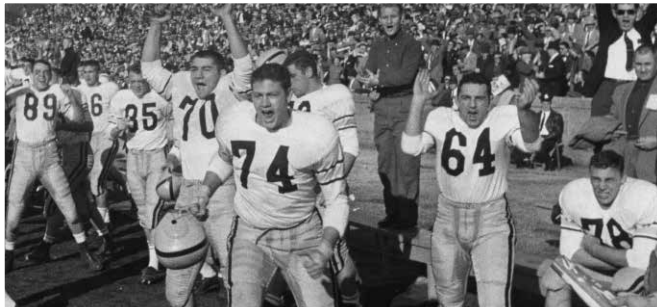
The 1955 team, shown celebrating a 34-0 shutout of No. 17 Kentucky, went on to register a 25-13 victory over No. 8 Auburn in the 1955 Gator Bowl.