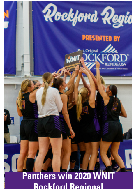
Panthers win 2020 WNIT Rockford Regional