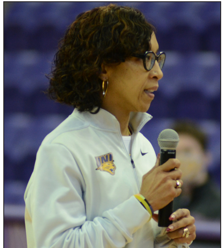
coached three All-MVC selections.