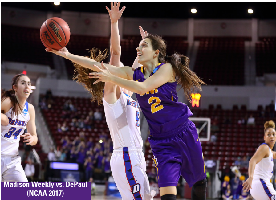
Madison Weekly vs. DePaul (NCAA 2017)