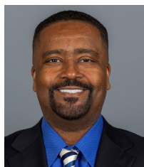
FRANK HAITH ASSISTANT COACH