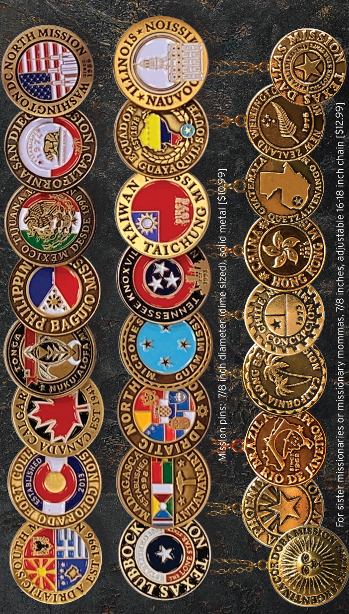
Mission pins: 7/8 inch diameter (dime sized), solid metal ($10.99)

CHECK OUT OUR COLLECTION OF MISSION COINS, PINS, NECKLACES AND MORE!