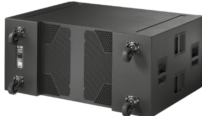
SL-GSUB for ground stacked applications